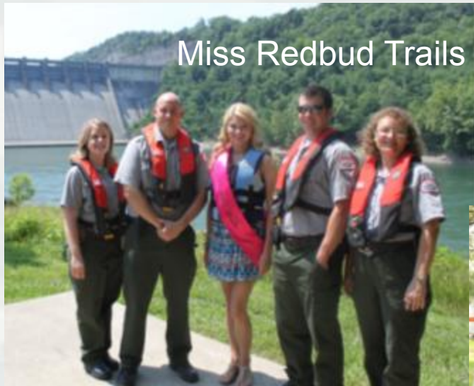
Miss Redbud Trails