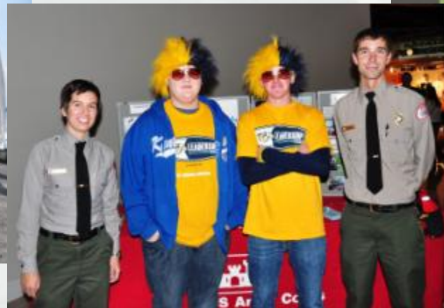
National Hockey League Predators