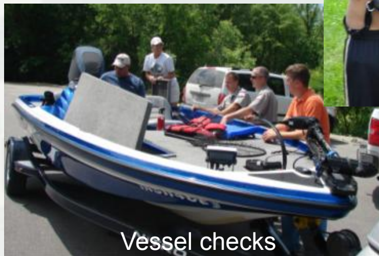
Recreation Area Exhibit