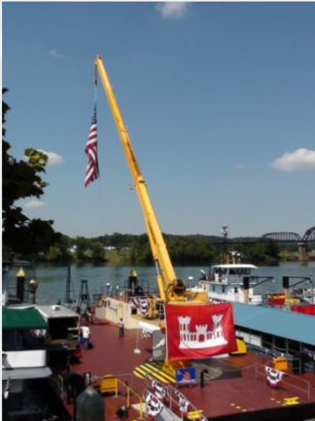
Corps Work Barge being Prepared for Event