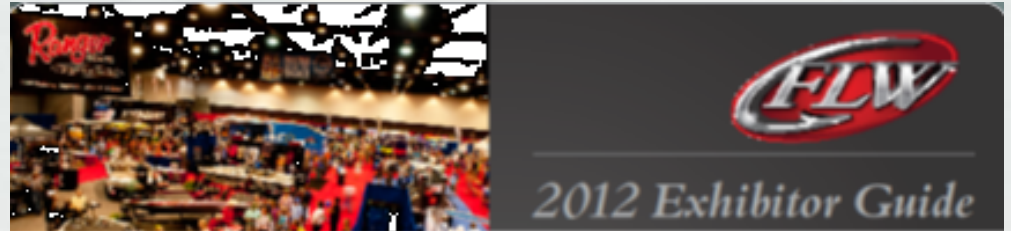
FLW Outdoor Expo – nation's largest fishing tournament organization at Lake Barkley