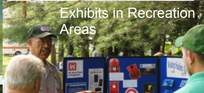
Exhibits in Recreation Areas