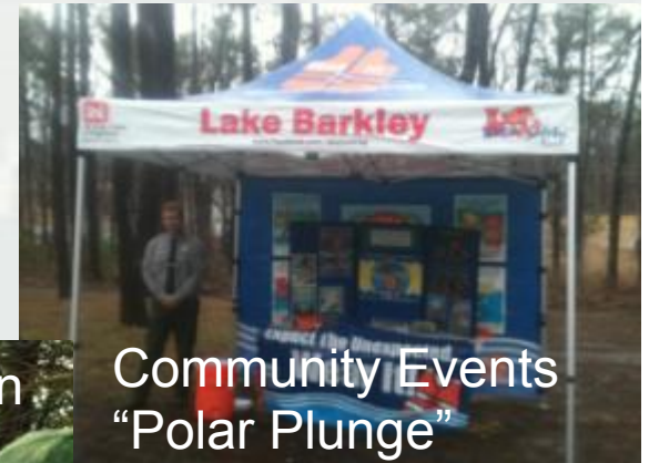
Community Events “Polar Plunge”