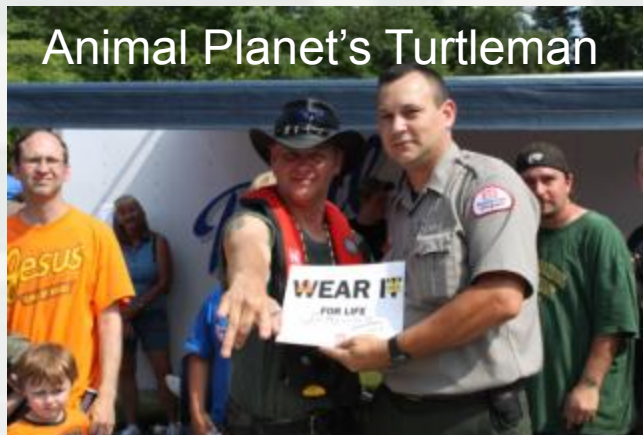
Animal Planet's Turtleman