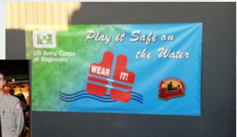
Nashville Sounds Baseball