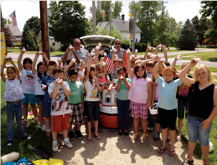
Cory with Friends